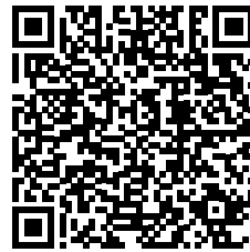
Pomeroy Inn & Suites Fort St. John