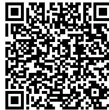
Pomeroy Inn & Suites Fort St. John